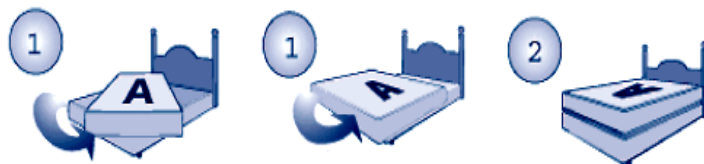
1. Rotate your mattress on top of box spring.